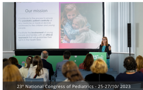
23º National Congress of Pediatrics - 25-27/10/ 2023

At the core of our activities is our role in supporting and facilitating pediatric clinical trials, using standardized c4c procedures to support sponsors and CROs throughout the entire lifecycle of pediatric studies, to optimize their planning and execution, from feasibility to recruitment. But the network also ensures a range of underpinning activities, providing multiple training content to professionals and the public, dialoguing with stakeholders such as competent authorities, other networks like PtCRIN, and funders, working to involve children, young people, and patient organizations, and contributing with academia to better understand the national pediatric research environment and landscape.