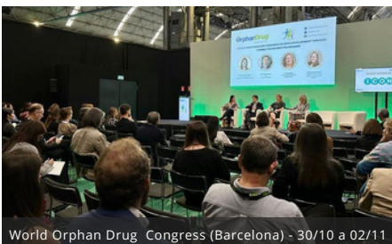
World Orphan Drug Congress (Barcelona) - 30/10 a 02/11